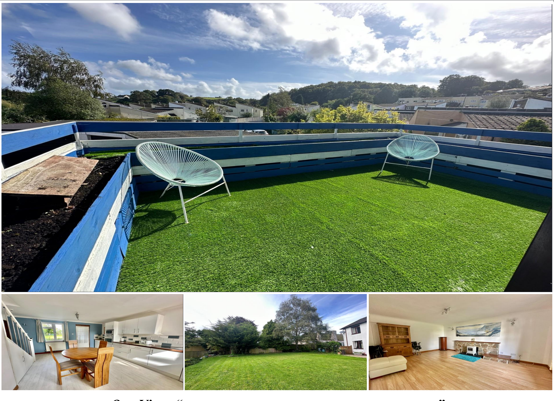
Our View "Delightful property set in the heart of the village close to amenities."

A well presented two bedroom property with spacious and modernised living accomodation, two double bedrooms, two shower rooms, an integral garage and terrace with village views located in a private spot in the heart of Abbotskerswell.