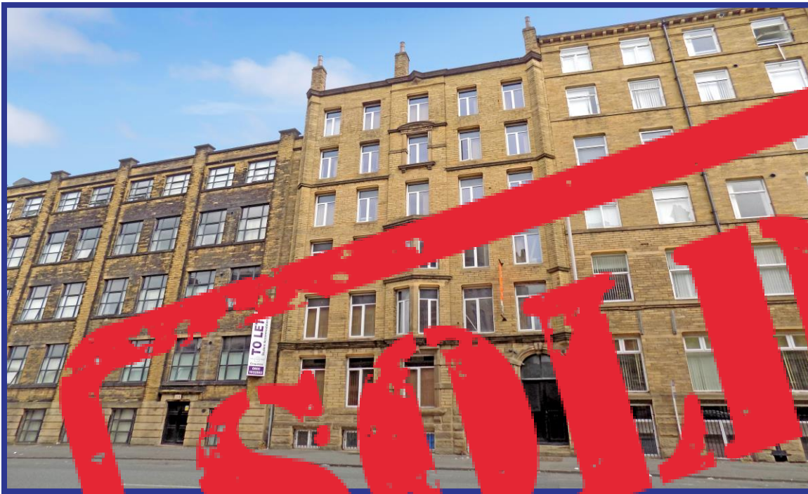
30 The Grand Mill Bradford, BD1 4PF