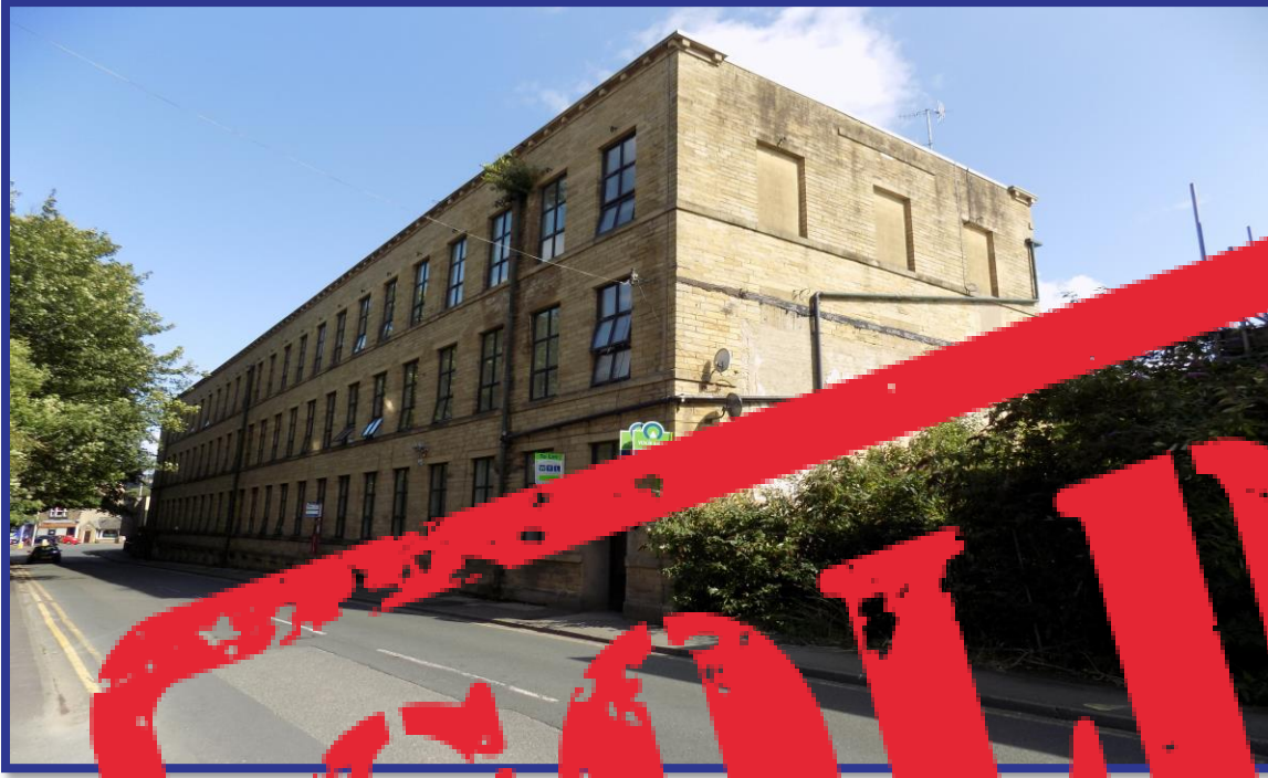
9 Ingrow Lane Keighley, BD21 1JH