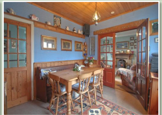
Mickleton, Barnard Castle, County Durham, DL12 0JY