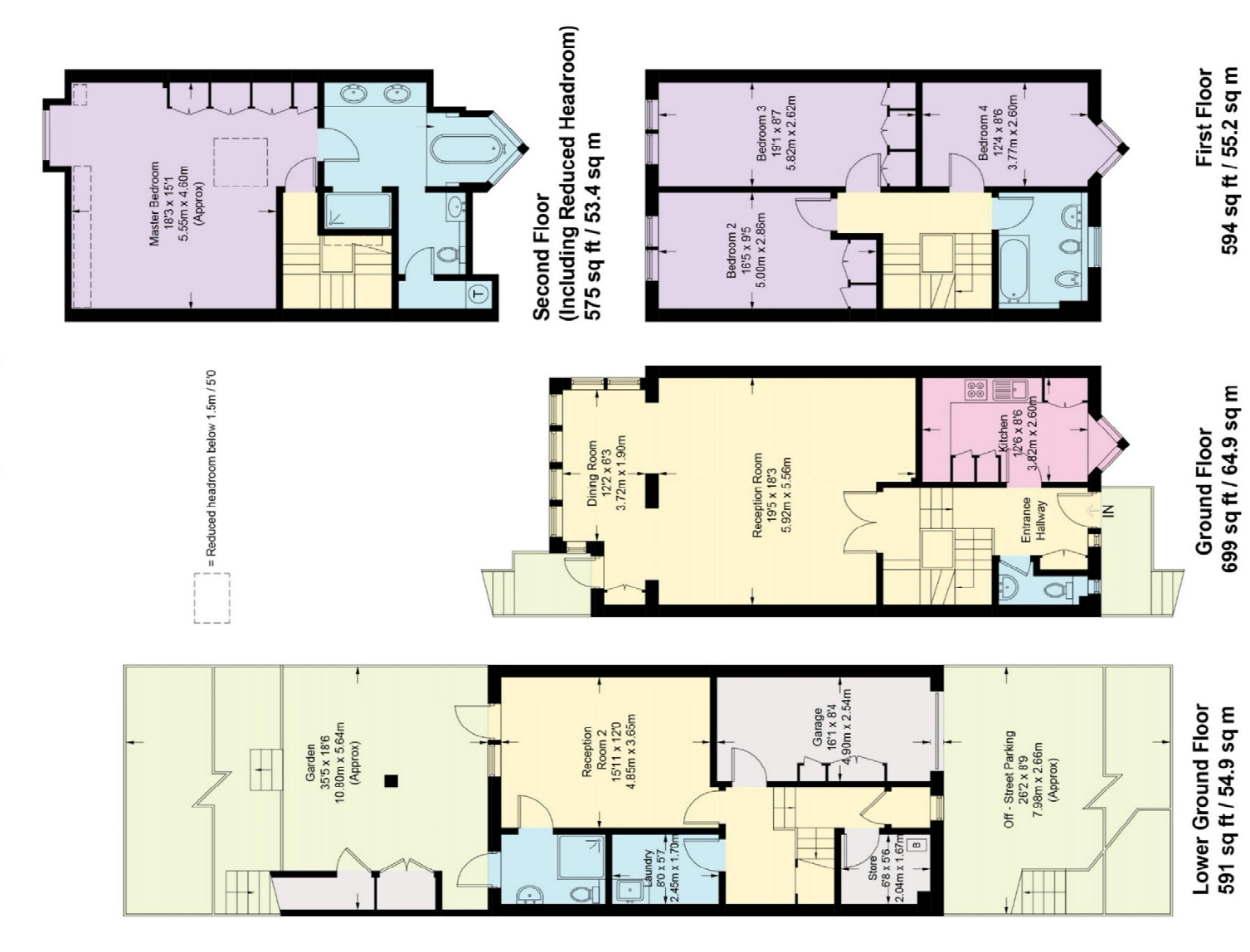
Illustration for identification purposes only, measurements are approximate, not to scale. (ID369029)

For full details on all available properties, please visit our website; www.litchfields.com or call our office on 0208 348 8000