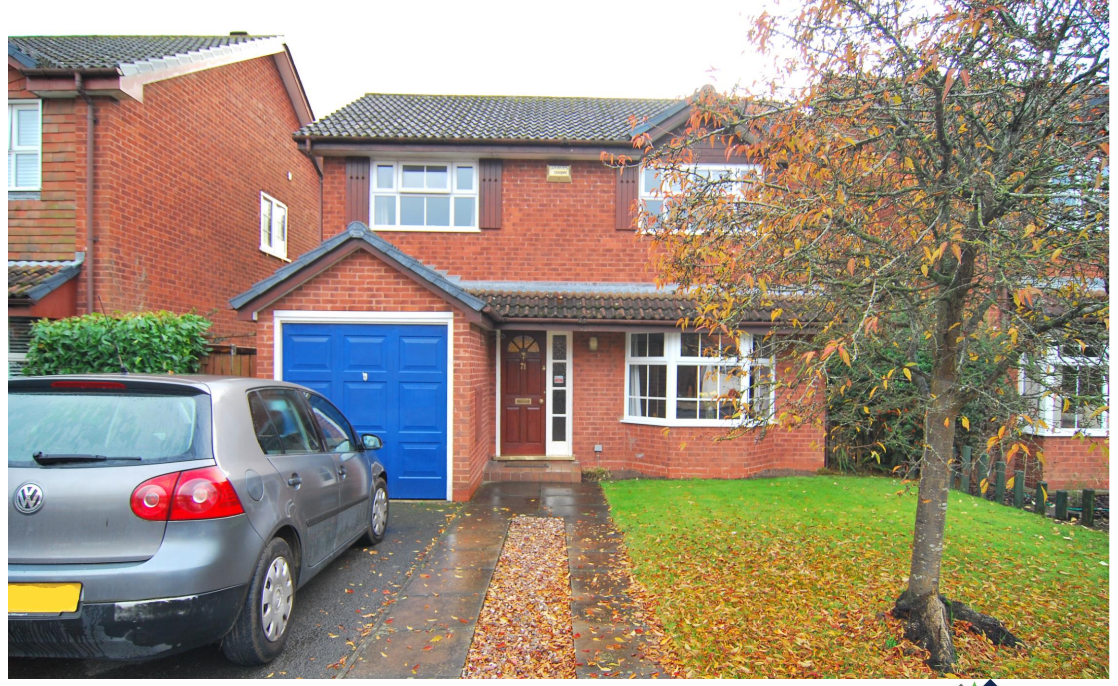
71 Gambier Parry Gardens, Gloucester, GL2 9RE