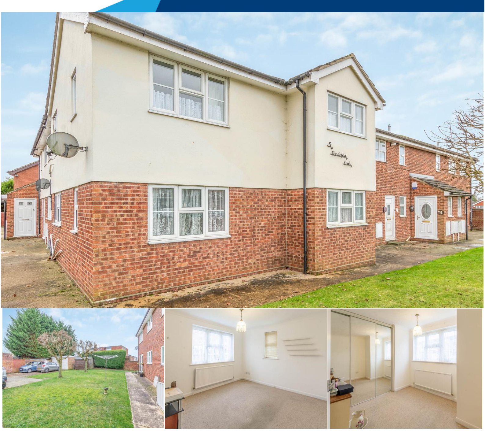
Bringing to the market this fantastic opportunity to obtain a one bedroom ground floor maisonette. Being marketed with No onwards chain this property offers the perfect First time buyer purchase. Internally you will benefit from an airy entrance hallway, spacious kitchen, lounge, bedroom and shower room. Externally you will gain allocated off road parking a communal garden area. Brilliantly positioned within the ever popular St Johns area you will benefit from being close to both local amenities and schooling.