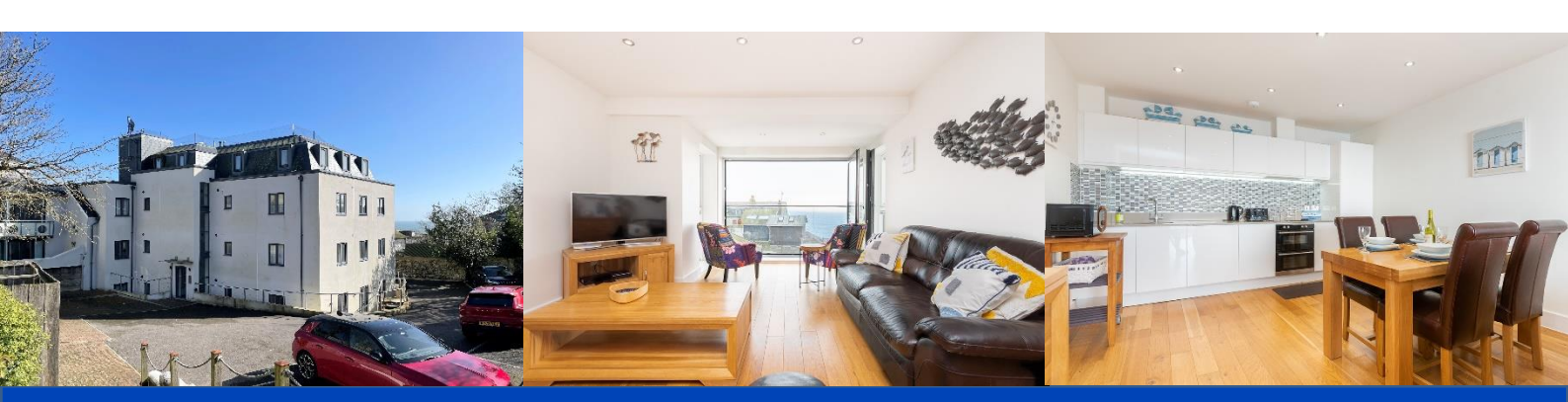
8 Holmcroft, 24, Broad Street, Lyme Regis, Dorset, DT7 3QE

OPEN/PLAN LOUNGE/DINER SUPERB SEA & COASTAL VIEWS EXCELLENT HOLIDAY LETTING POTENTIAL