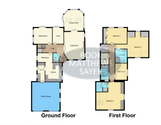
Total floor area 278.4 sq.m. (2,997 sq.ft.) approx