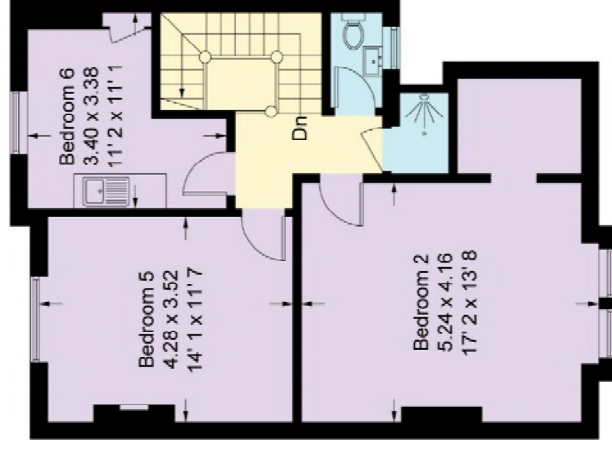
Second Floor 705 sq ft / 65.5 sq m