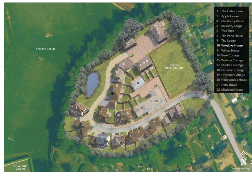
CHERRY TREE LANE, EWHURST, SURREY | A boutique collection of new homes Sat Nav: GU6 7RJ | T: 01483 677663 | E: cherrytreelane@mdh.uk.com | www.millwooddesignerhomes.co.uk MILLWOOD designer homes limited Part of Places for People