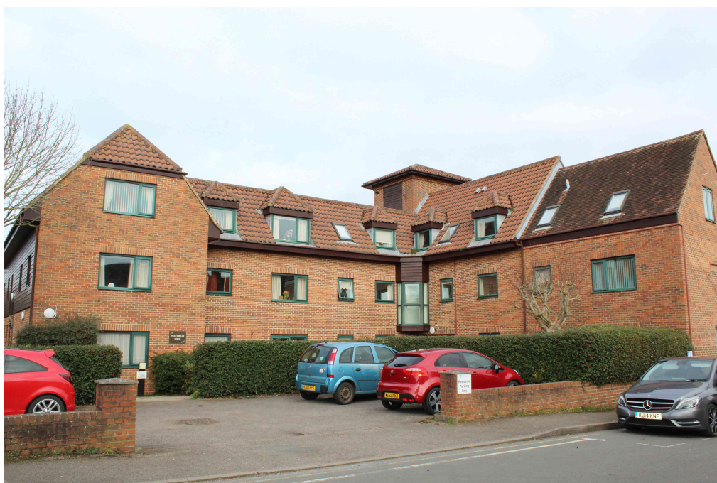
(Actual unit not shown)