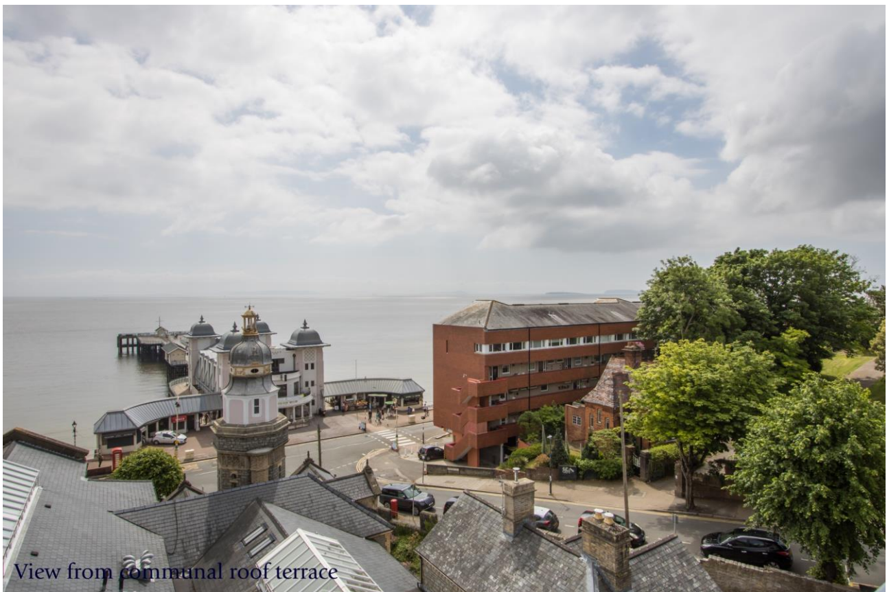
View from communal roof terrace