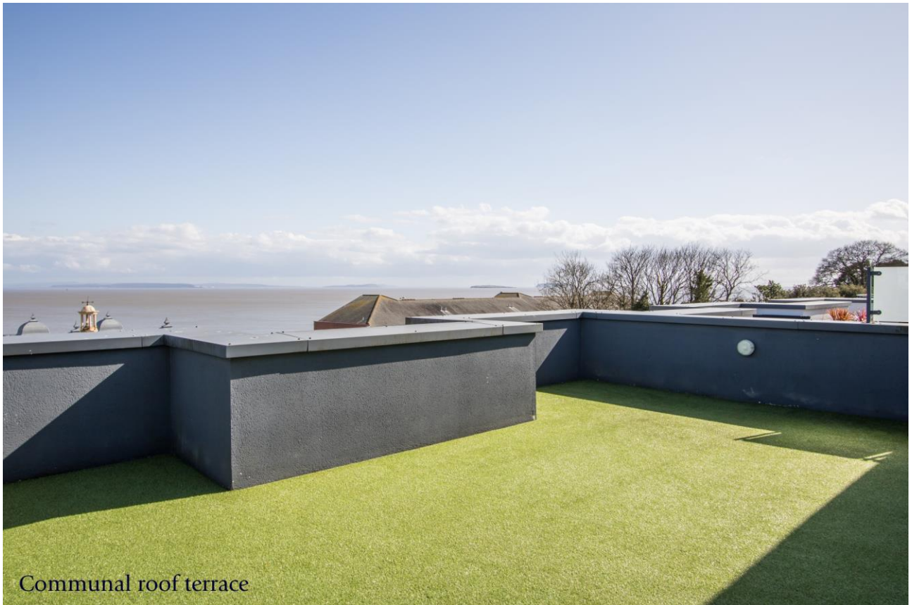
Communal roof terrace