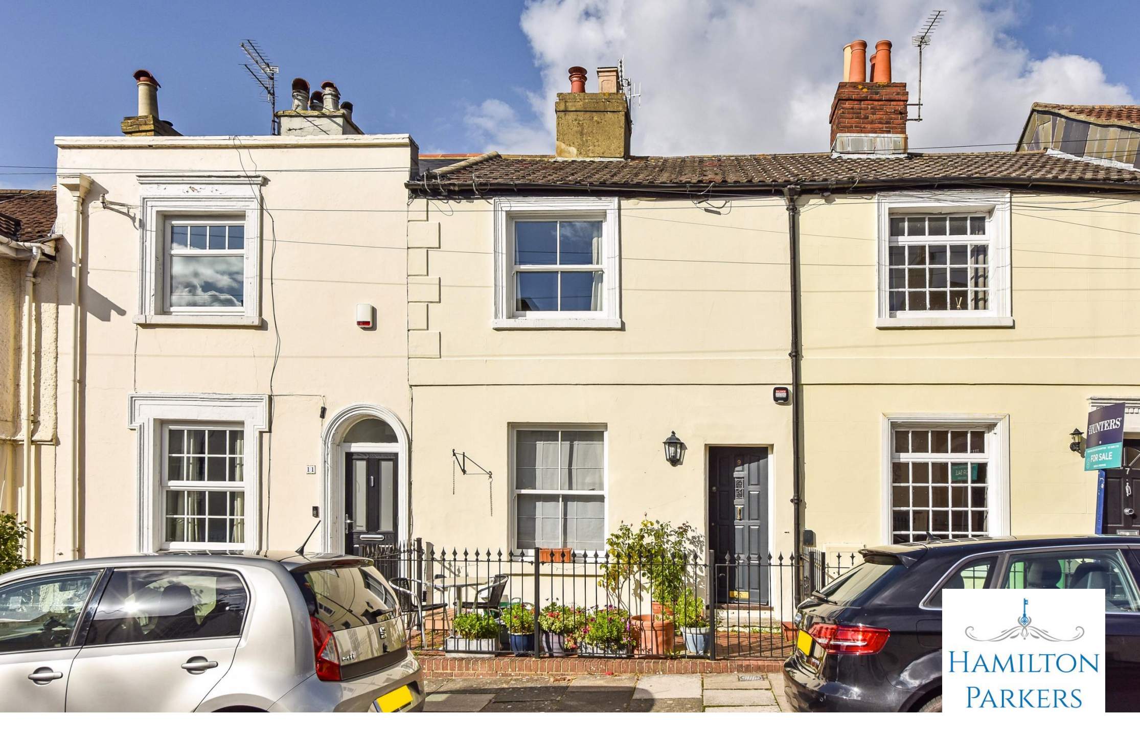
Canton Street, SO15 2DJ