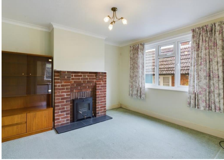
2 Stone Court Farm Cottages, Stone Court Lane, Pembury, Tunbridge Wells, Kent, TN2 4AB