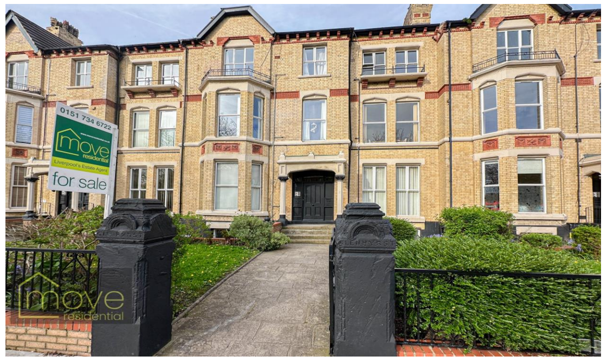
Princes Avenue, Princes Park, L8 2TB