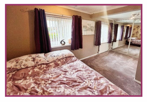
Bedroom 3: 10' 0" x 9' 7" (3.05m x 2.92m) uPVC double glazed window to the rear aspect, radiator below, fitted wardrobes and shelving, incorporating drawers.