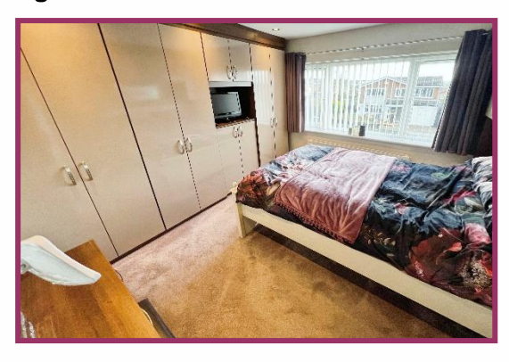
Bedroom 2: 15' 0" \times 8' 0" (4.57m \times 2.44m) 2 uPVC double glazed windows to the rear aspect, fitted wardrobes with sliding doors, two radiators.

uPVC double glazed window to the front aspect, radiator below, range of fitted wardrobes with overhead storage cupboards and a matching dressing table unit, radiator, inset spotlights to the ceiling.