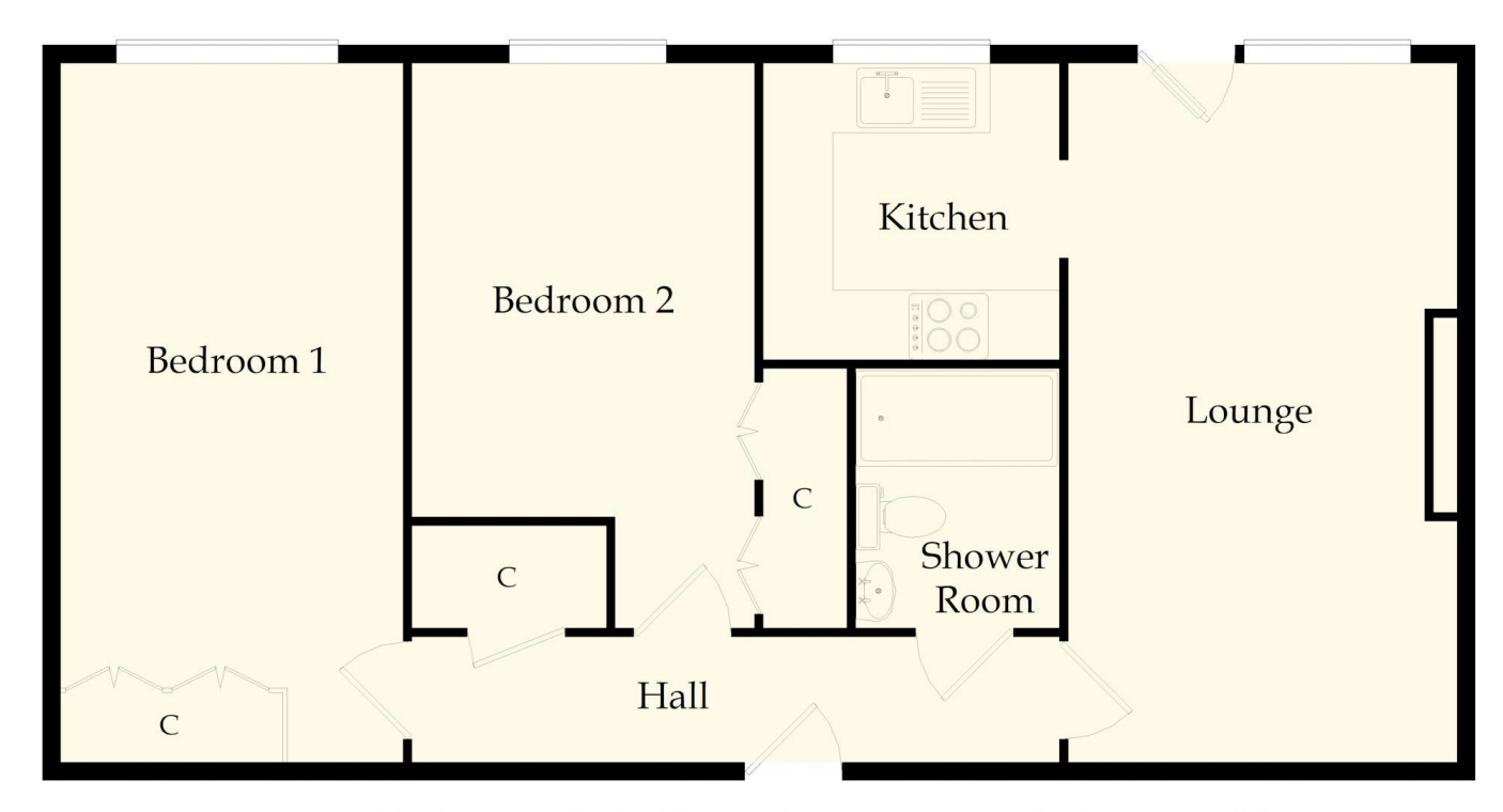
This drawing is for illustrative purposes only (not to scale) Copyright © 2012 ViewPlan.co.uk (Ref: VP24-JGH-1, Rev: A)