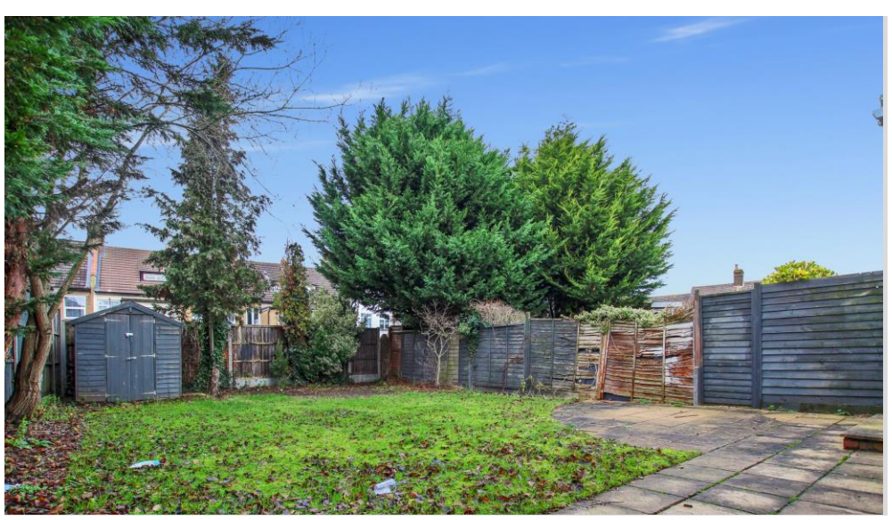
BEACONSFIELD ROAD BEXLEY KENT DA5 2AE £399,995 | Freehold