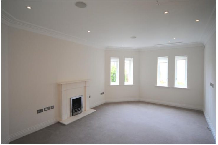
Havanna Drive, London, NW11