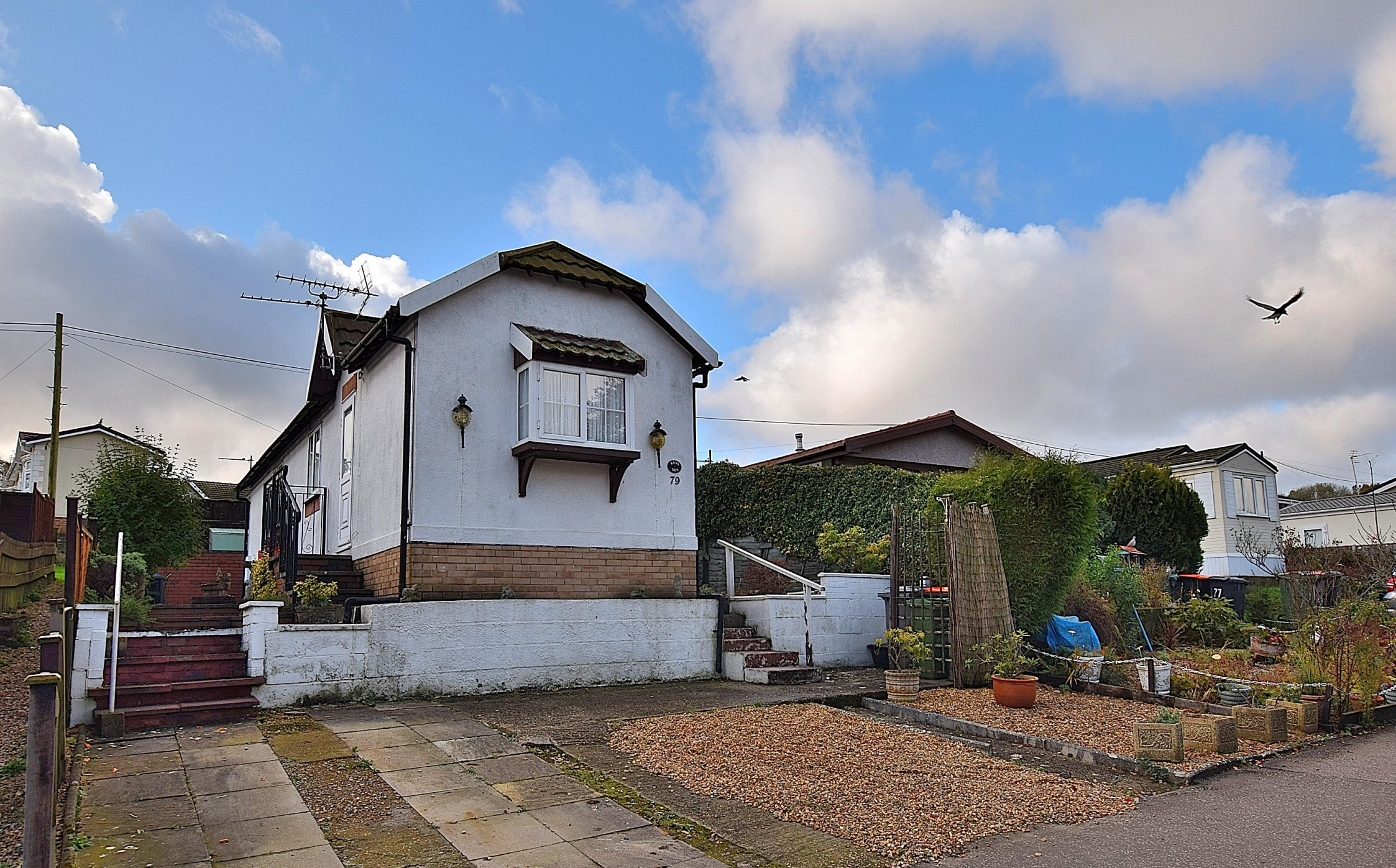
79 Whipnade Park Homes, Dunstable, LU6 2LW Guide Price £110,000