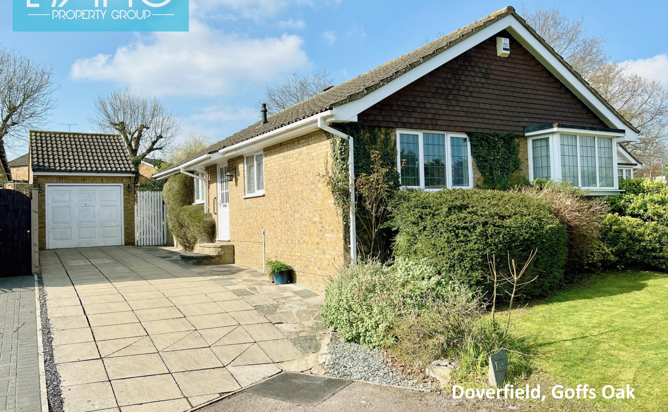
Doverfield, Goffs Oak