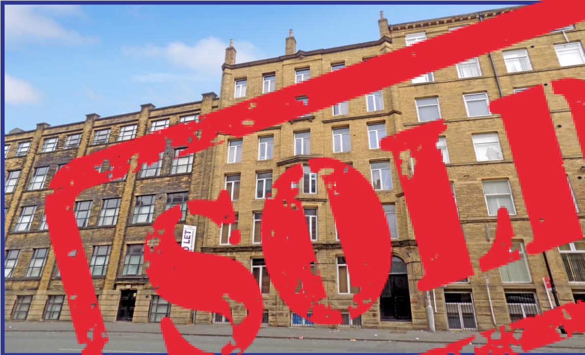
56 The Grand Mill, 132 Sunbridge Road Bradford BD1 2HF